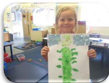
Table Tennis and Art inspired by David Hockney

Year 6 have been doing indoor sport and some amazing Artwork.